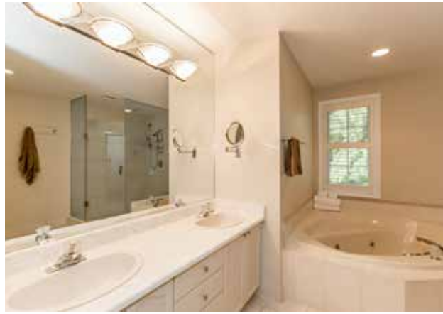
Large master with ensuite, good size bedrooms, clean and bright 3 piece bathroom. Lower level houses a large rec room, bedroom, 3 piece bath, lots of storage and access to the three car garage.