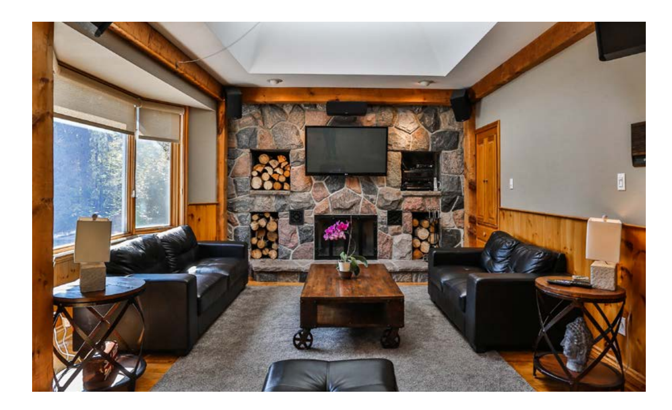
The family room provides warmth featuring wooden beams, a stonewall with a wood burning fireplace and large windows overlooking the pool.