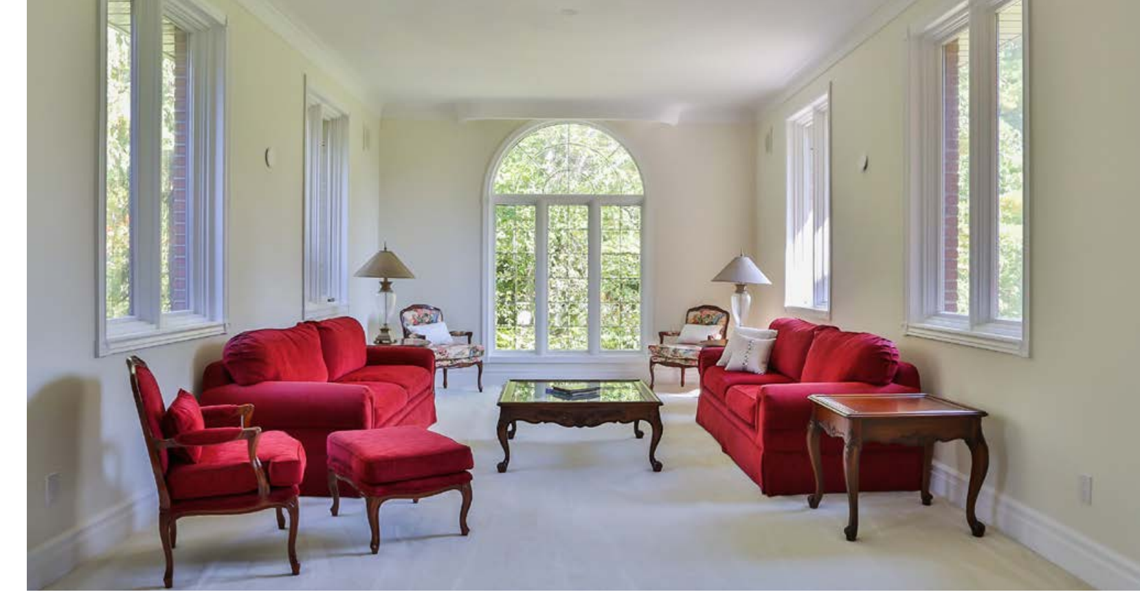
The grand living room, great for entertaining, is filled with natural sunlight with windows on three sides of the room. The large formal dining room overlooks the lawn and capitalizes on southern views.

The foyer is flanked on both sides with closets and once inside the home, you'll have the option to enter the grand living room, ascend the spiral staircase or immerse yourself in a private home office.