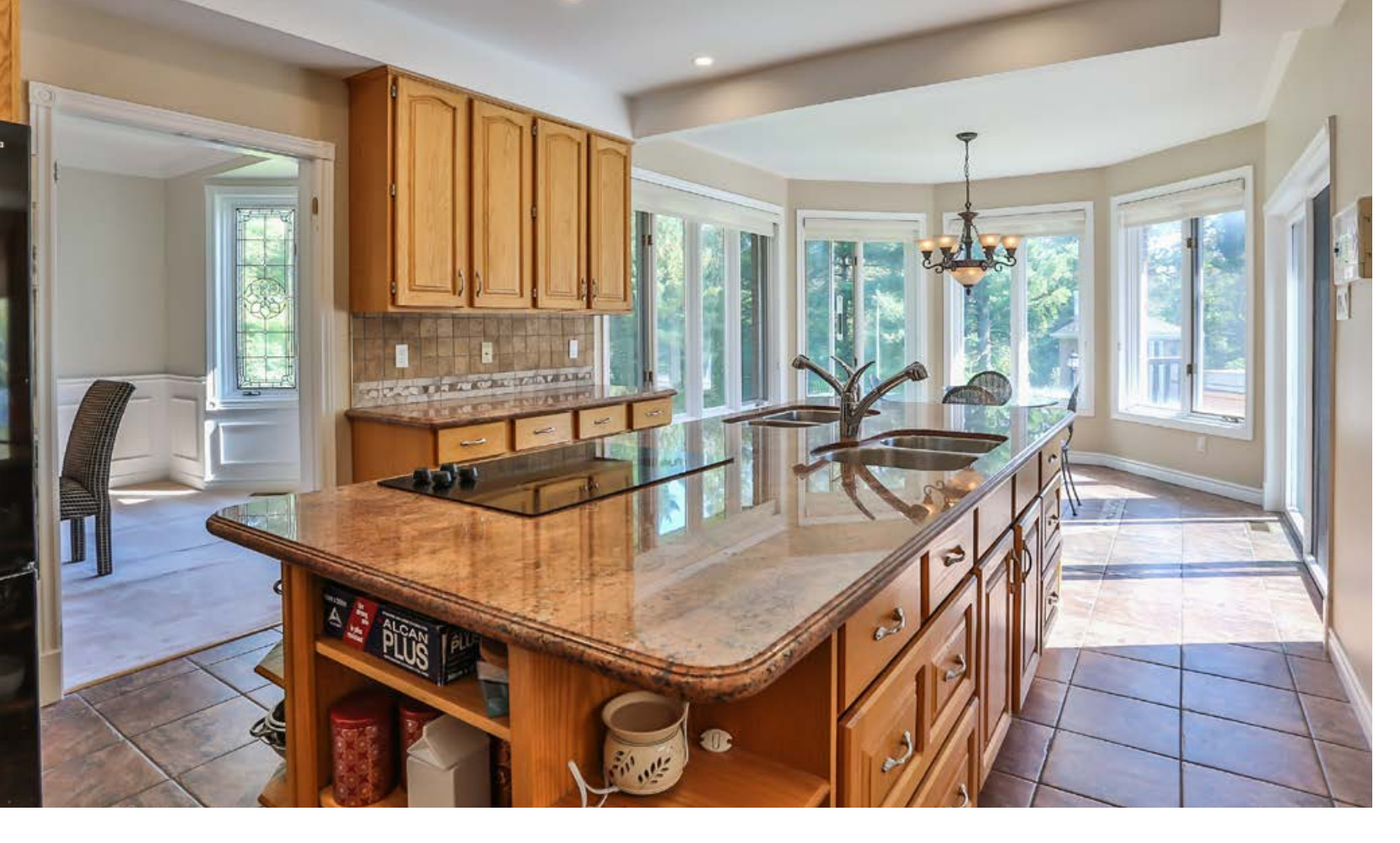
The kitchen is great for entertaining, featuring a large island with multiple sinks and a sit-in area for casual breakfasts and weekend meals.